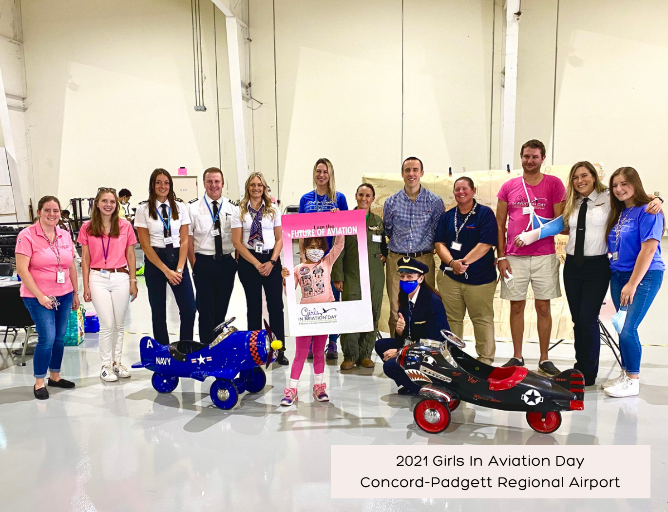
2021 Girls In Aviation Day Concord-Padgett Regional Airport